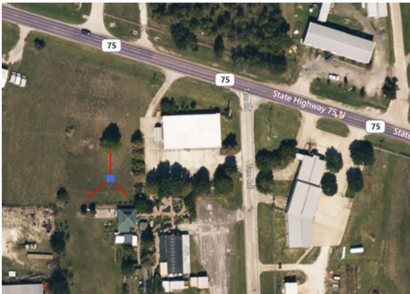
Tower Location with Guy Wire Anchors